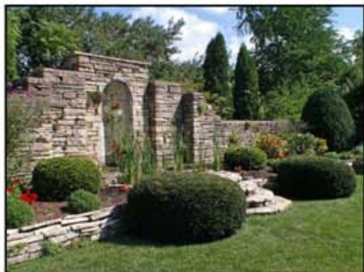
Scott Center Sunken Garden